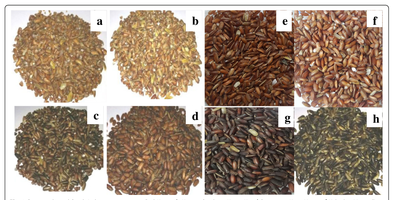
Fig. 2 Some traditional South Indian rice varieties. a Red Kavuni. b Kaivara Samba. c Kuruvi Kar. d Poongar. e Kattu Yanam. f Koliyal. g Maappillai Samba. h Black Kavuni Kavuni possesses anti-microbial activity. Kaivara Samba lowers blood sugar levels. Kuruvi Kar is resistant to drought and consumed by the locals for its health benefits. Poongar is consumed by women after puberty and is believed to avert ailments associated with the reproductive system. Kattu Yanam lowers glucose level in blood and also imparts strength. Koliyal is widely consumed as puttu, a specialty dish. Maapillai Samba has a hypocholesterolemic effect and anti-cancer activity and also improves fertility in men. Black Kavuni is resistant to drought and is popular among locals for its health benefits.

Protein is the second major component next to starch; it influences the eating quality and the nutritional quality of rice. In India, the dietary supply of rice per person per day is 207.9 g, this provides about 24.1% of the required dietary protein [2]. Rice has a wellbalanced amino acid profile due to the presence of lysine, in superior content to wheat, corn, millet and sorghum and thus makes the rice protein superior to other cereal grains [36]. The lysine content of rice protein is between 3.5 and 4.0%, making it the highest among cereal proteins. The endosperm protein comprises of 15% albumin (water soluble), globulin (salt soluble), 5–8% prolamin (alcohol soluble), and the rest glutelin (alkali soluble) [27].