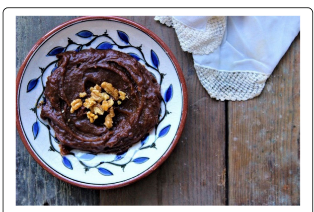
Fig. 11 Helhel is an example of Assyrian dessert that is eaten during fast day

Assyrian, Kurdish, Yezidi, and Armenian people in Mardin, which has hosted countless cultures and religions throughout thousands of years of history, are the main building blocks of the region's culture. Even though they have different beliefs after this interaction, this cultural wealth created a unique cuisine by positively affecting the food cultures. Various sources suggest that the basis of regional food culture is the Assyrian culture, which has a dense population in Mardin. Despite the variety of