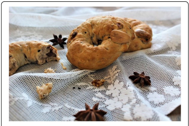
Fig. 2 Kliçe is an example of Assyrian-specific local pastry that is cooked for the Easter festival

Ingredients: ½ kg lamb meat, 1 kg onion, black pepper, red pepper, salt.