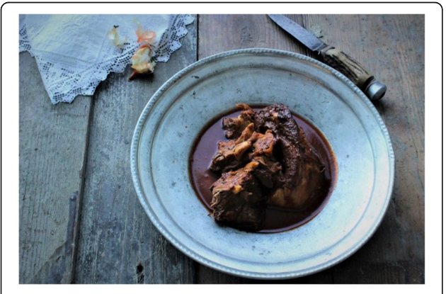
Fig. 6 Dobo is an example of Assyrian local meat dishes for the most valued quests

Ingredients: 2 kg minced lamb meat, 1 kg fine bulgur, 1 kg cracked wheat, pepper paste, salt, coriander for dough