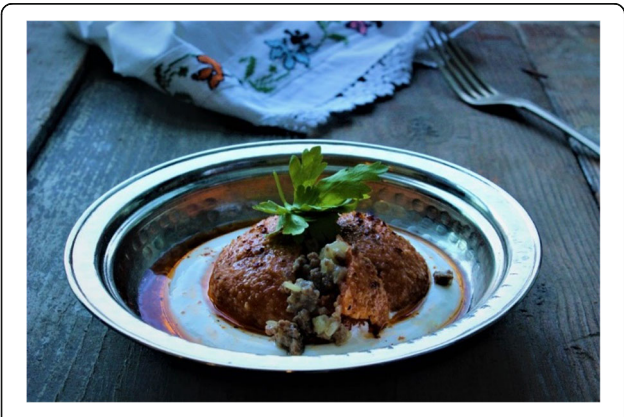
Fig. 10 Kitel Raha is a type of stuffed meatball of Assyrians that is served as the first meal after the fast day

It is a tradition to serve bun to Assyrians during the Easter festivals. This is a longstanding traditional food that Assyrians could not give up and called "festival cakes" when they cooked it during the festivals. Similarly, Muslims living in the same region cooked bagels which are called "Mevlid bagel" in Mevlids. It has been determined that both Muslim and non-Muslim communities practice similar eating habits at funerals and on certain days after death. Especially in the Eastern Anatolian region (Mardin, Adiyaman) where Assyrians live