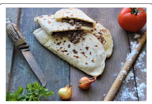
Fig. 9 Şembörek is an example of Assyrian dish that is served the day after the wedding at the breakfast

Ozer Journal of Ethnic Foods (2019) 6:26 Page 6 of 7