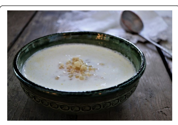
Fig. 12 Daşışto dugarso is an example of Assyrian dish that is eaten during fast day