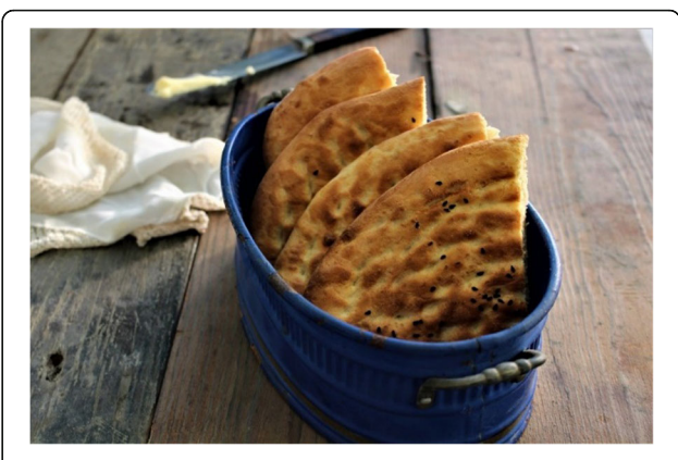
Fig. 3 Red pitta bread is an example of Assyrian-specific local bread that is cooked for the Easter festival

Preparation: Cook the meat. Then, add the chopped onions in large slices, salt, black pepper, and red pepper and cook thoroughly for 40 min (Fig. 5).