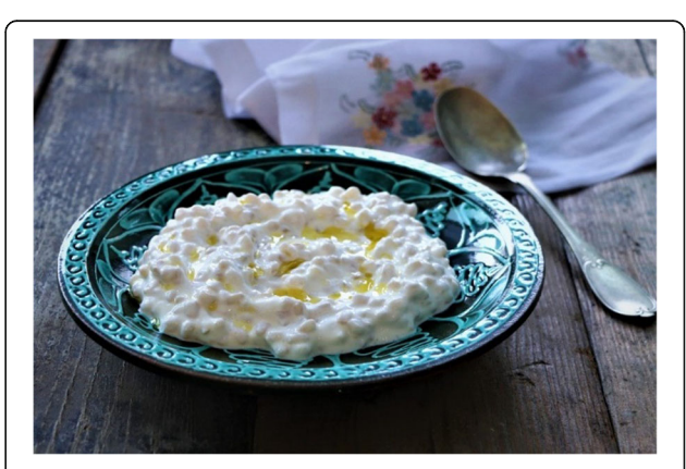
Fig. 4 Lebeniye is an example of Assyrian-specific local dish that consists of wheat and you'rt that are cooked for Easter festival

Preparation: Peeled eggplant is cut into a round shape and sliced to 1-cm thickness and lightly roast in oil. Other materials are kneaded as mixture. Then, 1 piece of eggplant, 1 slice of tomato, and the mixture are placed in a circle. Add tomato paste that dissolved in water into the mixture and cook for ½ hour (Fig. 7).