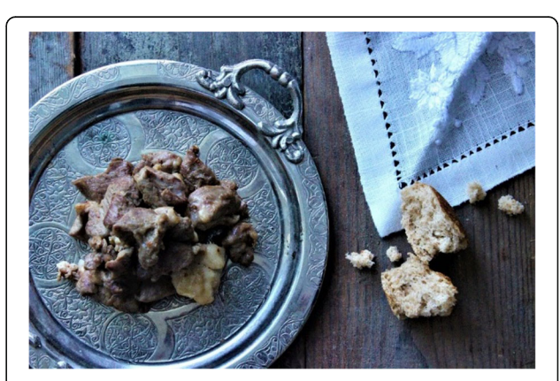
Fig. 8 Kavurma is an example of Assyrian Hano Kritho feast and wedding dish

Ingredients: 1 l milk, 100 g wheat, 700 ml water, 80 g sugar.