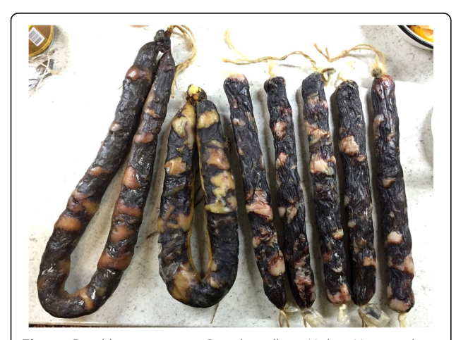
Fig. 11 Dried horse sausages, Petrjaksy village, Nizhny Novgorod region. After several months in the attic, the sausages are ready to be eaten. The sausages must be hard and dry before they are considered suitable for consuming. They are considered "mature" when they are hard enough. Children are sent up into the attic several times during April–May to check on the sausages, thus learning the right texture, color, and hardness. The sausages are cut into pieces and served in each family in the way they prefer, with potatoes, bread, or other dishes. Usually, no dry sausages are left when the next fresh sausages are prepared. Horsemeat sausages are considered a delicacy and they are a great favorite for all members of the Mishär Tatar household. Photo Elvira Umarova 2020

The debate in Finland after the international 2013 horsemeat scandal was polarized between the topics safe/unsafe, ethical/unethical, sacred/profane, and human-like/animal-like [47]. The social change is apparent: in agricultural Finland more than a century ago, horses were considered "real" horses; they were kept for practical and financial reasons. Today horses are companion animals [37]. The considerations, which shook Finnish society, have little or no significance for the Mishär Tatars. Eating horsemeat is a tradition and practiced,