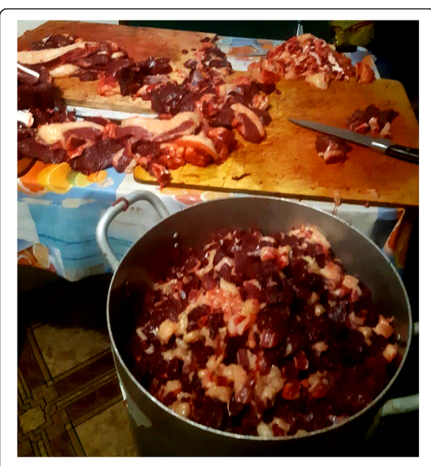
Fig. 3 Chopped horse meat is being prepared for sausages. In Petrjaksy village, Nizhny Novgorod province, a Tatar family prepares the contents for the sausages. The traditional dried horse sausage, kazy , is still very popular in the Mishär Tatar villages in Russia. In the village setting, the sausages are made by the family members with help from neighbors and friends. Urban Tatars and those living in the diaspora in Saint Petersburg and other large cities buy their sausages from meat shops. Those who have relatives or a house in a village can also get or prepare their own home-made sausages.

Svanberg et al. Journal of Ethnic Foods (2020) 7:38 Page 5 of 11