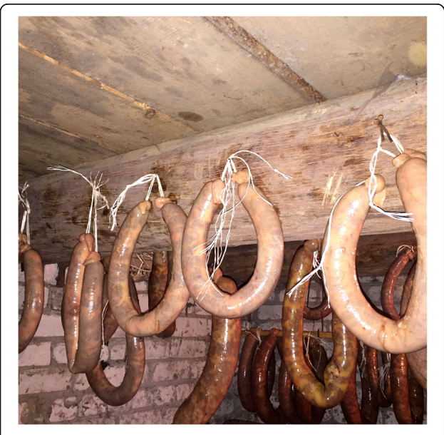
Fig. 6 Horsemeat sausages, kazy , need to dry in a cool place where air moves freely. They were traditionally prepared in winter or early spring, when snow was still on the ground. The men did the slaughtering, and the women and children prepared the meat, bones, internals, and other parts of the horse for different dishes. The women kept the knowledge of how to cook and prepare horsemeat, but the men also joined in the work to prepare the sausages. Among Mishär Tatars, the gender division of work could be ignored when required. Women and men also eat horsemeat products together and not separately, like for instance among the Kazak. Photo Elvira Umarova 2020, Petrjaksy village, Nizhny Novgorod region

A quality steak was fried and eaten with bread. The meat was however mainly prepared for sausages, which was considered the most important horsemeat product. If the meat contained a lot of fat, the fat was cut away and not put into the sausage, but chopped into small pieces, salted and then melted. If meat pieces stuck to