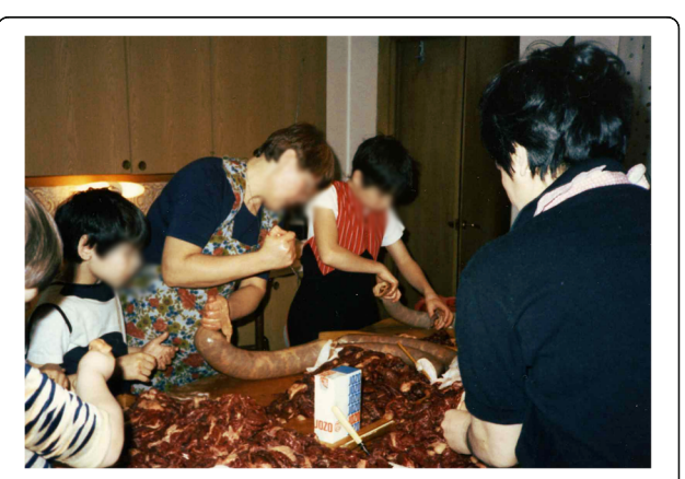
Fig. 4 Horse sausage making in Helsinki, Finland. Adults and children work together to fill meat into the washed horse intestines and making small holes with sticks in the sausages to let out air. The Mishär Tatar diaspora in Finland has for more than a century kept their food traditions. Horsemeat sausages are considered a delicacy, but they are also the result of joint effort. The adults transmit traditional knowledge and skills in cooking Tatar dishes by involving everybody in the process of preparing. The children observe and try their hand at every phase of the sausage preparation. The meat must be cut into suitable size and the intestines filled tightly, which requires training and experience. Photo Fazile Nasretdin 1986

In Saint Petersburg, horsemeat could be purchased in Tatar butcher shops. Each co-owner of a horse