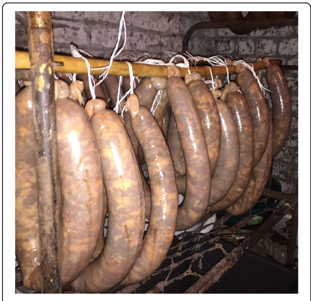
Fig. 5 Freshly made horsemeat sausages in Petrjaksy village, Nizhny Novgorod region. For the sausages, the most important thing is to store them in a suitable place. During the first night after preparation, the newly meat-filled intestines are left in the kitchen, where any excess liquid drops off. Then the horse sausages are stored in the attic, where they will dry and slowly get the right texture, color, smell, and taste. Usually, they are hung from the ceiling to get enough air. The sausages need several months to dry and mature before they can be eaten. If the sausages are not ready by the end of May, a night in room temperature in the kitchen will speed up the process. After maturing, the sausages can be kept in a newspaper in the freezer.

Traditional horse meat recipes are for instance salted meat, aygyz (oygoz) from ribs and argamak, a piece of boiled-smoked foal (without bone), and a large intestine turned inside out and fried with fat. Kazy or sausage remains the main course prepared from horsemeat, possibly because it has always been cheaper than other products. Sausages are also easier to prepare, preserve, and distribute outside the village context, and the manufacturing technology can take into account various taste preferences of the consumers. Kazy can be served boiled, dried, raw-smoked, or boiled-smoked. Among Mishär Tatars from the Nizhny Novgorod province it is more customary to produce kazy in the dried and smoked forms [40, 42, 43].