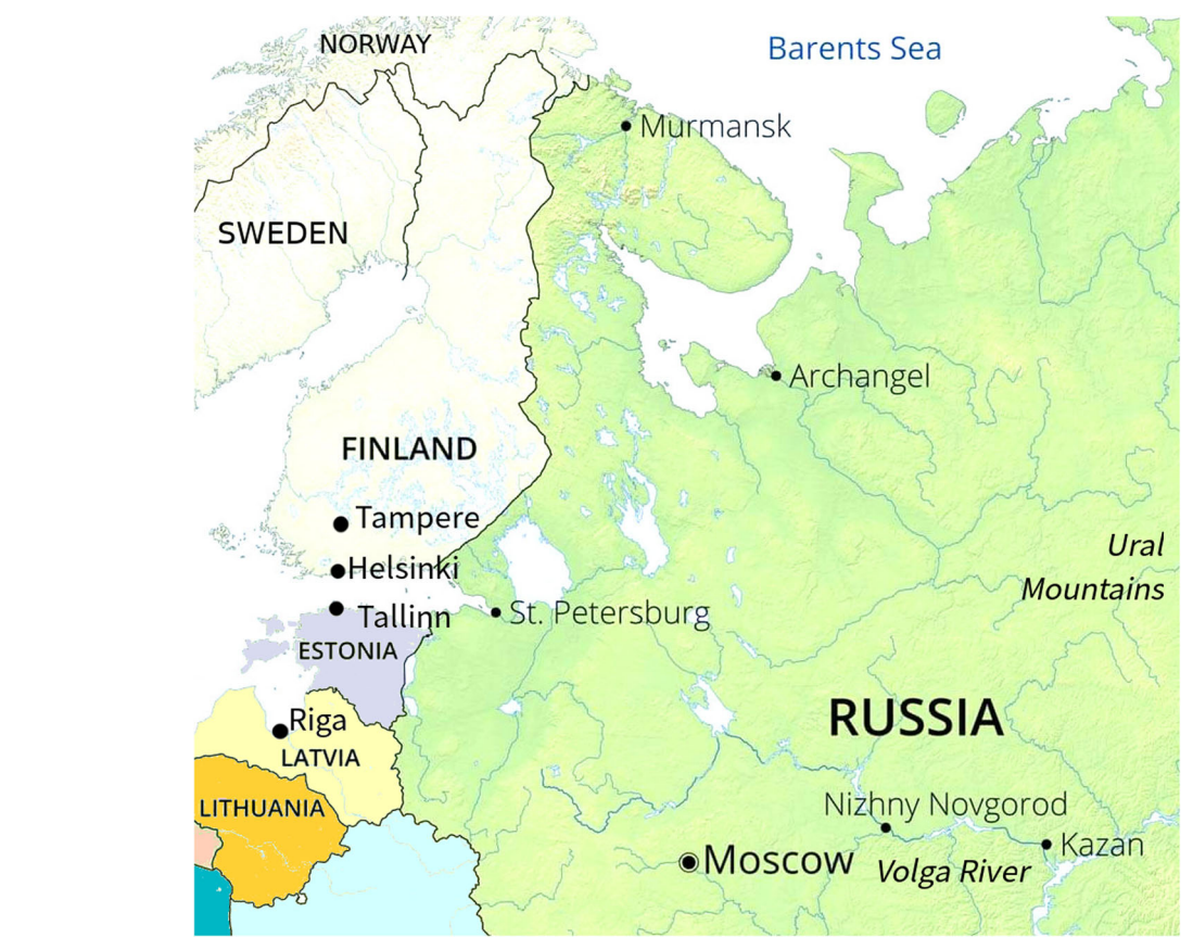
Fig. 1 The settlements of the Kazan, Kasimov, and Mishär Tatars are located in and around Kazan (Tatarstan) and in the Nizhny Novgorod province south of the Volga River. The migration of Mishär Tatars from the Volga region took place in the late nineteenth and early twentieth century. Larger diaspora settlements are found in Saint Petersburg and Moscow in Russia, Estonia (mainly Tallinn), Latvia (Riga), and Finland (Helsinki, Tampere, and Järvenpää). Saint Petersburg functioned as the starting point for the Mishär Tatars from several villages in the Nizhny Novgorod province, who traded and settled in the eastern Baltic Sea region. Some Mishär Tatars also live in Sweden and Germany, but their numbers are very few today. The Tatars in Poland and Lithuania are the descendants of earlier Tatar migrations. Courtesy of the Nations Online Project, to the map has been added a few towns and cities where Mishär Tatars live, https://www.nationsonline.org/oneworld/map/European-Russia-map.htm

Svanberg et al. Journal of Ethnic Foods (2020) 7:38 Page 3 of 11