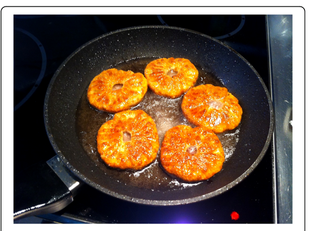
Fig. 7 A popular dish and important for the Mishär Tatar identity is pärämäç, also pronounced peremech or pärämäts. This pastry is filled with minced meat and chopped onion and a little salt and black pepper. The dough is rolled out into flat disks of 10–15-cm radius. A few spoons of meat mixture is added and flattened. Then, the edge of the disk is folded up neatly, leaving a small round opening. The round peremech pastries are either fried in a pan or oven-baked. Optionally, peremech is made with potatoes for a non-meat or lighter variation.

In late spring, usually at the end of May in Finland, the sausages had matured and were ready to be eaten. The family went up regularly to check on them. In houses with small holes for the attic, children were sent up every day by a grandmother or grandfather to check the state of the sausages, increasing their expectations. The surface must be completely dry and the sausage hard. If a sausage looked a bit raw, it was taken down to