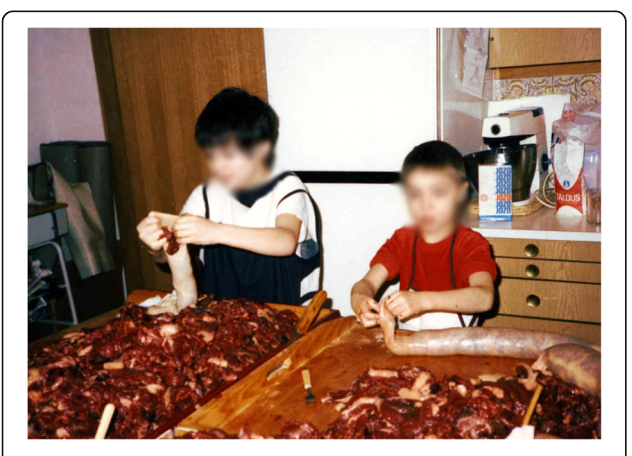
Fig. 8 Horse sausage making in an apartment kitchen, Helsinki, Finland. The children participate actively from an early age in the work, filling the intestines with meat and making sticks for the ends of the sausages. The sticks are used to make holes in the sausages to let out air and also to fix the ends, from which the sausages are hung. The methods of sausage making among the Tatar diaspora in Finland remains very much the same as in the ancestral villages in the Volga region. Today, they have access to modern kitchen equipment, however, which facilitates and speeds up the preparation process. Photo Fazile Nasretdin 1986

In contrast to some other Turkic peoples, such as the Kazak, Mishär Tatars do not separate women and men when consuming horsemeat. Gender rules and generation roles among the Tatars exist, but can be overruled according to the situation. Traditionally, after slaughter the men usually took care of the skin, and the women