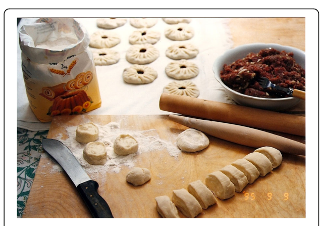
Fig. 10 Preparing peremech , the traditional Tatar pastry, is besides horsemeat sausages a joint activity, which brings Mishär Tatars together. Learning to fold the edge in the right way is a skill children acquire from an early age. Usually, peremech is prepared in big quantities by many people together for celebrations or guests. When Tatars meet, the talk often turns to food and eventually to peremech . Even just talking about the pastries awakens positive memories and feelings and brings Tatars closer to each other. Peremech pastries are consumed with sour cream or fat yoghurt, pickled cucumbers, or other pickled vegetables, but every family has their own preferences for the serving. Leftovers can be frozen, in the rare case there are any. Photo Fazile Nasretdin 1995

Another aspect is the usual respect for traditions and elders. Horsemeat is part of the Mishär Tatar tradition. What is its significance for the diaspora Tatar identity in the eastern Baltic Sea region, and does it contribute to conserve or create a specific Mishär Tatar identity? More than a century ago, horseflesh was the main meat dish for the ancestors. The generation who migrated from the village still slaughtered and prepared their own horsemeat products, but today food production has become industrialized and ready-made products such as