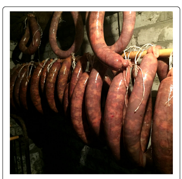
Fig. 9 Fresh horse sausages drying in the attic, Petrjaksy village, Nizhny Novgorod region. In the wooden village houses, the attic is used for drying the sausages and storing food. In the Volga region, the climate is very cold and dry in the winter, cool in the spring, and hot in the summer. The attic keeps cool until May–June, which makes spring a suitable period for preparing the sausages. In the diaspora and especially in city houses in Saint Petersburg or Finland, Estonia, and Latvia, storing the sausages is more complicated. Saint Petersburg and Helsinki, for instance, are both located by the sea, and humidity levels can be high.

Svanberg et al. Journal of Ethnic Foods (2020) 7:38 Page 9 of 11