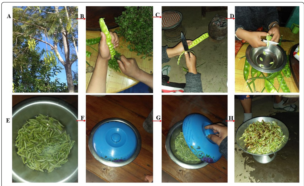
Fig. 3 Nkampitam is a popular dry season food item; in the making of this chutney, mature beans, chilli, salt, dry fish and fermented vegetables are used. a Bean gets mature in the month of December, and the month is appropriate for making chutney because of softness and tenderness. b Mature beans are plugged from the tree, and peel is removed by using indigenous made peeler. c After removing its peel, the harder side-layer is removed by a kitchen knife. d Slice into small pieces. e The sliced pieces are transferred to the pot. f Then, add a small quantity of water, and cover and boil for about 10 min. g When it is boiled, pot cover is removed, and the boiled beans are transferred to the plate. h Chilli and dry fish or fermented vegetable seeds are pounded, and then beans are marinated.

Atungbou Journal of Ethnic Foods (2020) 7:41 Page 5 of 9