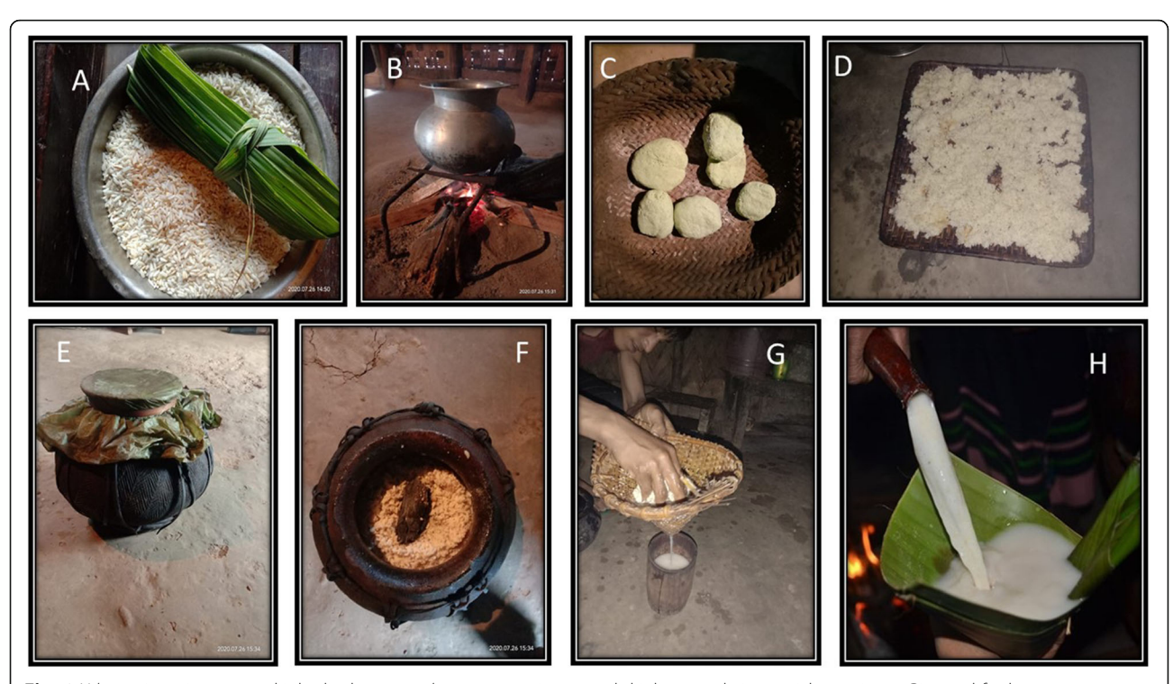
Fig. 6 Nduizou is an important drink, also known as herazou meaning sacred drink, use only in special occasion. a Rice and fresh sugarcane leaves are in place for making nduizou and yeast. b First step is to cook rice for making nduizou . c In the making of nduizou , yeast is added; yeast is made of sugarcane leaves and soaked rice. First, soaked rice is pounded, later sugarcane leaves are cut into small pieces and mixed with pounded soaked rice and pounded again. Once it is done, small quantity of water is added, squeezed with hand, made into cookies size and dried up. d Cooked rice is transferred to bamboo tray and kept for 1 h, and then the yeast is mixed. e Mixed cooked rice and yeast is shifted to pot and covered with banana leaf. f Mature beer is ready to consume. g Rice beer is soaked in water and filtered in a traditional bamboo filter, Zou singrak . h Filtered rice beer is kept in gourd and put into the palm cup made of banana leaf.

Atungbou Journal of Ethnic Foods (2020) 7:41 Page 8 of 9