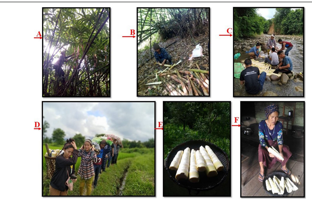
Fig. 5 Kechui-nnang is another type of bamboo shoots fermentation widely practiced by the Zeme tribe. a For this method of fermentation, grown tall bamboo shoots are collected; this bamboo shoot is in between becoming full bamboo but still the shoots are edible, the lower part is a grown bamboo but upper part is still remain shoots. b After cutting the tall shoots, the shoots are gathered in one place and the sheaths are removed. c Bamboo shoots are washed with water before taken to home. d Clean bamboo shoots is kept in traditional basket or shaken and taken to home. e Upon reaching home, clean bamboo shoots are unloaded and kept in traditional tray. f One by one, bamboo shoots are cut into equal size (vertical) and loaded in conical bamboo basket.

Atungbou Journal of Ethnic Foods (2020) 7:41 Page 7 of 9