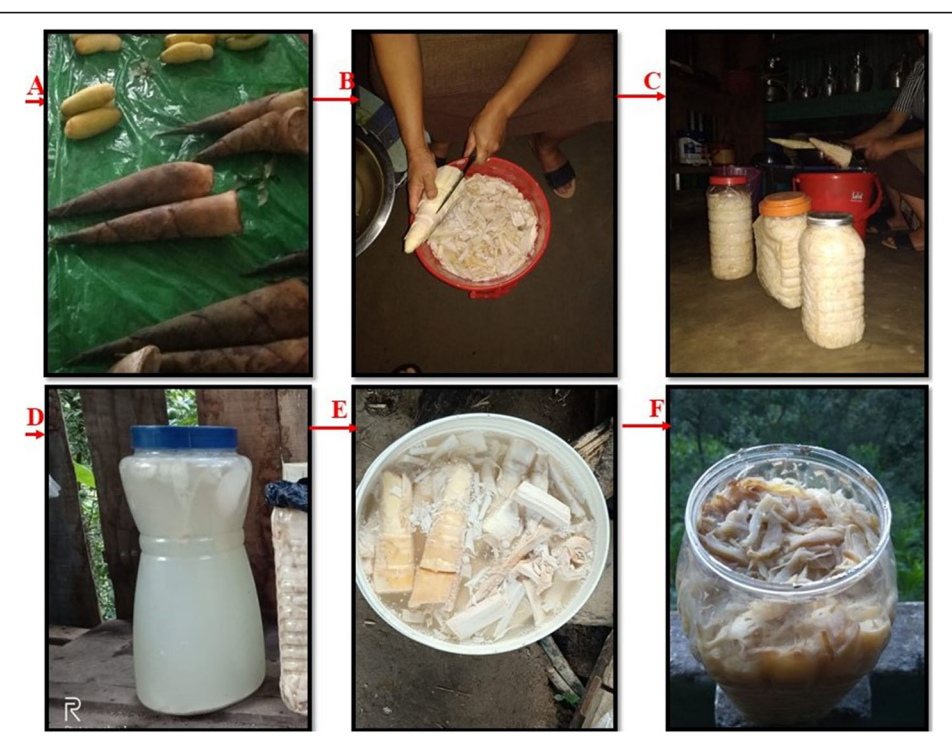
Fig. 4 Kechuihia is made from fresh tender bamboo shoots. a Tender bamboo shoots are collected from the forest, and sheaths are removed and washed with water. b The washed bamboo shoots are sliced into pieces. c The sliced bamboo shoots are transferred to containers, with little amount of water, containers are covered and kept for a week. d Once the bamboo shoots are fermented, juice is transferred to a different container. e After filtrations of juice from the fermented shoots, the shoots are transferred back to the container. f Fermented shoots are ready to use in vegetable and non-vegetables curryThe second type of fermented bamboo shoot is called kechui-nnang (Fig. 5). The collection of bamboo shoots for making kechui-nnang happens in the first week of August and ends in the first week of September. In the process, the grown shoots are collected with the help of hook or by chopping off from middle then remove sheaths, shoots are washed with water and cut into two equal sizes (vertical), and put in a conical bamboo basket lined with banana leaves. After the equal size of the shoots is put in the basket, the outer layer is covered with banana leaves and place two-three stones on top. Then, the bamboo basket is tied to the post. Fermentation of bamboo shoots may take 20 or more days. In the case of former (kechuihia), both juice and shoots are eaten while in the latter case, only shoots are taken but it can sustain throughout the year. Both types of fermented bamboo shoots are cooked with both vegetables and meats. Most importantly, preparing with pork is one of the most popular dishes among the Zeme.

Atungbou Journal of Ethnic Foods (2020) 7:41 Page 6 of 9