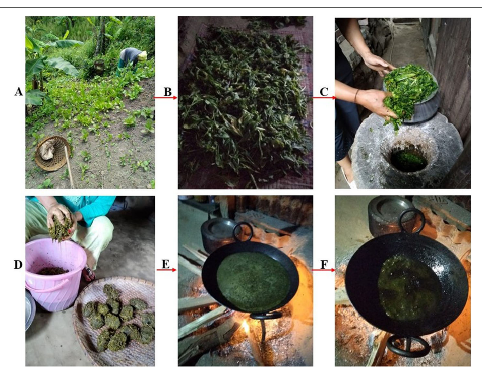
Fig. 2 Njetim is a popular fermented food stuff and ever-ready to consume; there are certain procedures to be followed in makings one. a Mature mustard leaves are collected from the field/farm, washed with water to make sure that there remains no dirt or mud. b The washed leaves are kept in byliang (traditional bamboo tray), in a selected room for a few days to enable the green leaves to turn yellow. c Yellowish leaves are pounded in traditional rice pounder called kepha , then pounded leaves are transferred to pots, added with some water and again kept for some days. d Once the pungent turn in a few days, its juice is squeezed out, and the remains called njetak used for curry or chutney can also dry, njetim . e Juice is boiled with salt before boiling; its juice is filtered in traditional filters made of bamboo. f Once the juice is cooked, it is transferred to a small pot and kept above the fire hearth called krab .

Parkia is one of the most popular dry season food stuffs and one of the major income generated non-timber forest products. In Zeme, it is called nkampi . It is harvested in winter and ends up by the early spring. There are certain procedures that have to be followed in the making of nkampitam (Fig. 3). A mature bean is plugged from the tree, the peel is removed, sliced into small pieces and boiled. When it is cooked, the beans are mixed with chilli and dry fish or fermented local vegetable seeds. It