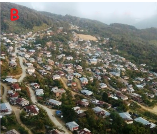
Fig. 2 Visual representation of the study sites A N.E Tlangnuam village; B Phuaibuang village

interviews. Since the two ethnic groups speak a distinct language, the names of the local dishes, and methods of preparation were recorded in their language and translated into 'Mizo' with the help of a language translator. The responses documented in Mizo language by the volunteers were translated in English by the authors. The entire documented recipes were photographed, and the description is given in English.