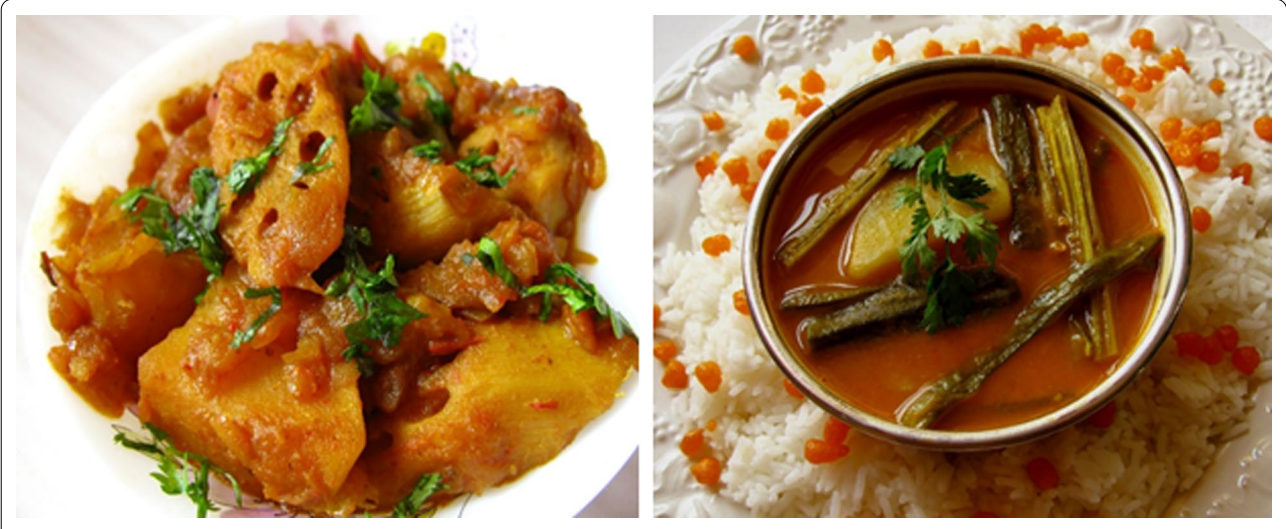
Fig. 1 a Seyal bhey patata; b Sindhi kari.

Rana J. Ethn. Food (2021) 8:32 Page 5 of 10