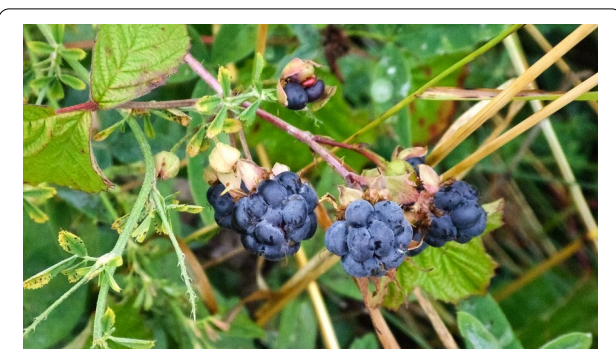
Fig. 7 Delicious dewberries, locally known as salmbär , are common all over the island of Gotland, but grow mainly in the southwestern part, and less in the eastern and northern parts, which are more open to the winds from the Baltic Sea. The berries ripe in July to August. They must be gathered only when completely mature to give the specific taste to the jam; otherwise, the jam will be too sour. Much sugar is needed to cover the acid taste of the berries, but children like to eat the berries also fresh. These berries were photographed in July 2008 by a road in Vibble, Gotland, Sweden

The dewberry is nowadays considered a regional Gotland specialty and has become a terroir, part of the local character, embodying certain qualities of the island and symbolizing its food culture. The concept terroir includes in this context everything the earth gives, from the influence on the taste to the cultural-historical context forming the final product [55, 60, 67]. Also the story behind the dewberry, gathering and picking, the local habitat, its connections, and last but not least, the creative process