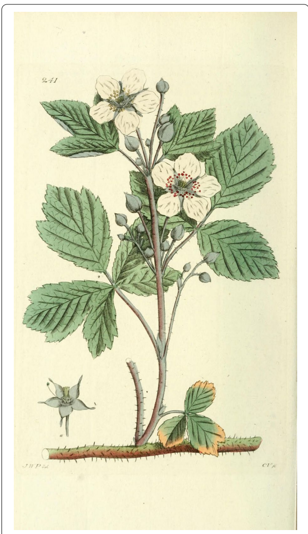
Fig. 3 An early nineteenth-century illustration of Rubus caesius , showing the flowers, berry, root, and leaves. European dewberry is a small shrub with hairy leaves and biennial stems, which die after fruiting in their second year. The plant sends out long runners, which root at the tops to create new plants. In this illustration, the dewberry looks very dark blue, almost black, but the illustrator has with great fidelity to the original captivated different parts of this rarely used plant before the arrival of the twentieth century and greater availability of sugar (Source: C. Quensel & J.W. Palmstruch Svensk botanik vol. 4, 1805)

In Flora svecica (1745 and 1755), Linnaeus noted several local and provincial names for the dewberry in Sweden: kalvhjortron 'calf cloudberry' (Uppland); käringbär 'old woman berry' (Västergötland); björnhallon 'bear raspberry' (Östergötland); björnbär 'bear berry' (Småland); skottluva 'bullet cap' (Bohuslän); and noted for the first time by Linnaeus in 1749, käringtarmar 'old woman intestines,' in the southernmost province of Skåne [36]. In Uppland, the berry was also called åkerhallon 'field raspberry' [37, 38].