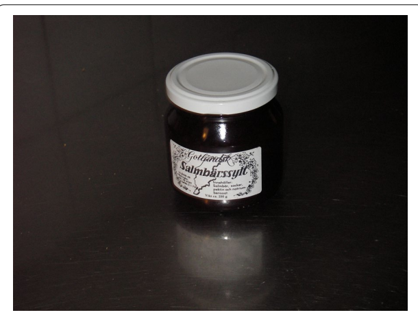
Fig. 8 A jar of dewberry jam manufactured by a Gotland company. Currently there are several small, local factories producing dewberry jam, which is mainly sold to tourists and served in restaurants on the island together with saffron pancake. An increasing amount is also brought to the Swedish mainland and sold in delicatessen stores, shops specialized in food from all over the country, and in the weekly or seasonal markets in Sweden

regional food and ingredients can be brought in from the margins of geography to national and global consciousness and plates within a very short time span, and they might become part of a globalized foodscape within just a few decades or even years. Often TV and internet are the means for transmitting culinary news, and traveling chef shows focus with gusto on local dishes or ingredients.