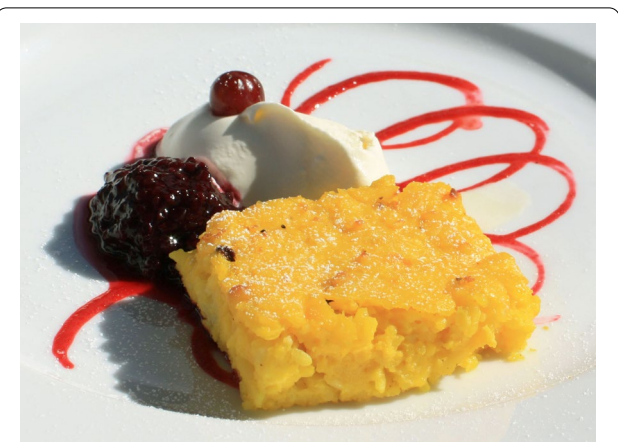
Fig. 2 Oven-made saffron pancake is a century-old traditional dessert from Gotland and considered a typical provincial dish connected with this island located in the Baltic Sea. Saffron pancake was earlier served only in connection with weddings and other festivities. This 'cake' is made of pudding rice, cream, milk, sugar, egg, chopped almonds, and flavored with saffron, which gives its typical yellow color. Nowadays, saffron pancake is a common dish especially in local restaurants and cafes catering for the 1.5 million tourists visiting Gotland every year. The pancake is usually served lukewarm with dewberry jam and whipped cream, along with coffee