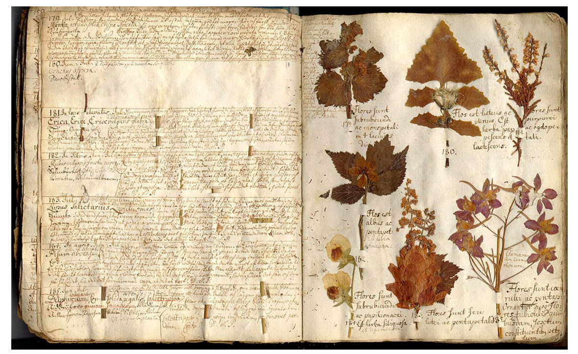
Fig. 4 A sheet from Antonius Münchenberg's handwritten herbarium vivum with a voucher specimen of Rubus caesius in the middle. This is the oldest dated collection of plants from Gotland. It contains besides illustrations also notes (diagnosis) about the uses and 'virtues' of various species. Most of the specimens in this collections were gathered in Hejde parish in the central part of the island during 1701 and 1702. The herbarium further offers some old Guthnic phytonyms

In the herbarium, there are also some original records about the uses or virtues of plants, probably collected by Münchenberg. Several of these original records are of interest for ethnobiologists and linguists and deserve further examination, as there are