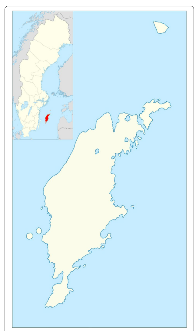
Fig. 5 (Map 2) Gotland is an island with approximately 58,000 inhabitants and more than a million tourists every summer. This picturesque, small, roughly leaf-shaped island is located in the Baltic Sea about 90 km east of the Swedish mainland. For several decades, Gotland has been a hugely popular tourist destination. Today gastrotourism is one of the fastest growing parts of the tourist business, but also the small traditional houses in the capital Visby attract visitors, as well as the natural sights, rocky shores, and beautiful meadows, which can be visited for instance on bicycle (Map: CC BY-SA 3.0 Published under the terms of GNU Free Documentation License)

Salmbärsbris , flavored with dewberries. An interesting recently invented tradition is the so-called Polhemsba-kelsen , a pastry developed in Visby in 2008, containing vanilla cream, dewberry jam, and whipped cream. It is served in cafes on the name day of Christopher on March 15. This tart is named after the Swedish inventor and scientist Christopher Polhem, who was born on Gotland in 1661 (d. 1751) [62] (Fig. 6).