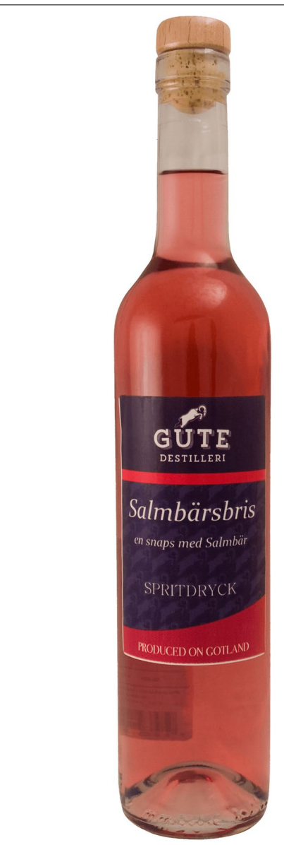
Fig. 6 Salmbärsbris is a locally produced, light pink dewberry-flavored schnapps produced by Gute Destillery. It is sold mainly in the liquor stores on the island of Gotland, where it is very popular with tourists, but can also be ordered in stores in mainland Sweden. The main Swedish provider of alcoholic drinks, Systembolaget , also offers it in shops up to 150 km from the original production location. The schnapps has a fresh, slightly bitter taste, and according to the advertisement, this schnapps has a 'berry flavor with influences of dewberry, raspberry and citrus peel.' It contains no allergens and should be served cool, like any schnapps

Salmbärsbris , flavored with dewberries. An interesting recently invented tradition is the so-called Polhemsba-kelsen , a pastry developed in Visby in 2008, containing vanilla cream, dewberry jam, and whipped cream. It is served in cafes on the name day of Christopher on March 15. This tart is named after the Swedish inventor and scientist Christopher Polhem, who was born on Gotland in 1661 (d. 1751) [62] (Fig. 6).