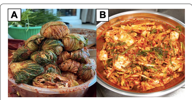
Fig. 5 Different types of baechu kimchi based on the preparation manner of Chinese cabbages: A pogi kimchi made from whole cabbage heads whose leaves are neatly wrapped and stuffed and B mak kimchi made from small pieces of cut cabbages mixed with other ingredients