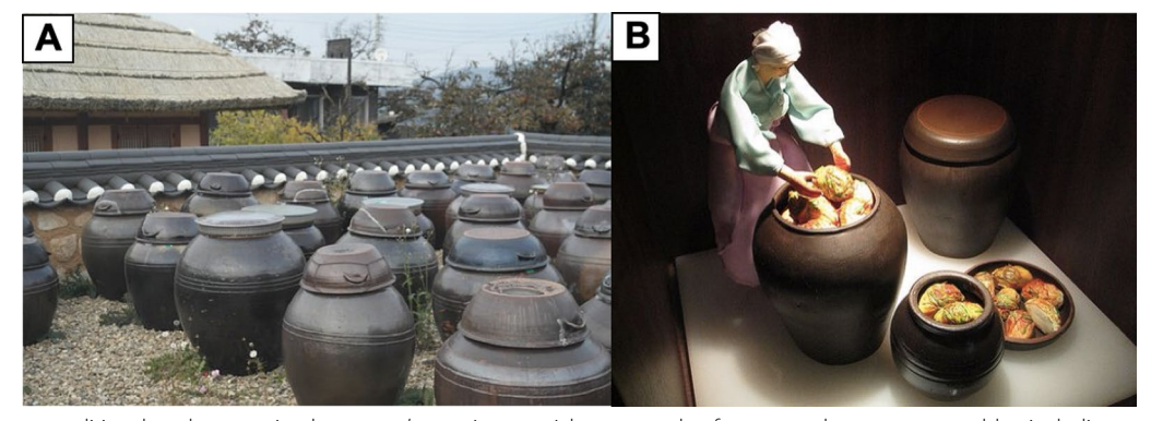
Fig. 1 A Korean traditional earthenware jars known as hangari or onggi that are used to ferment and preserve vegetables, including to produce kimchi. B A diorama at Museum Kimchikan (formerly Kimchi Museum) in Seoul, South Korea, showing a Korean woman putting brined cabbages into earthenware jars to make kimchi

Kimchi is the most important traditional fermented food in Korea. Historically, the tradition of making kimchi among Koreans started as a necessity of storing and