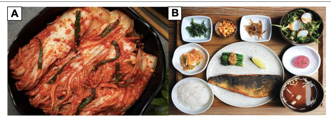
Fig. 7 A Kimchi is made from ingredients of different colors that respect the philosophy of the five elements and B a complete Korean meal with kimchi presents the complete five different colors according to the philosophy of the five elements: red, white, green, yellow, and black