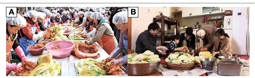
Fig. 4 Kimjang, a traditional communal kimchi-making culture for consumption in winter that can be done at the community level (A) or family level (B)

Kimjang is a laborious culinary activity that can span several days and requires the hard work of entire families or neighborhoods. The most common kimchi produced during kimjang is tongbaechu kimchi made from Chinese cabbage. During kimjang, cabbages are present in very large quantities. They are cut in half or quarter prior to soaking in salt water for a day and draining. A brightly red marinade is prepared using ginger, garlic, radish, carrot, green onions, starch, and red chili powder (gochugaru). Anchovy extract and fermented prawn paste can also be added for extra richness. It is noteworthy that in traditional kimjang, the chopping and mixing of all ingredients is done manually by hand, a painstakingly long affair with no shortage of hard work. Oftentimes, the whole process of kimchi making also involves squatting down for a prolonged period, thus resulting in muscle aches. After mixing all the ingredients, kimjang participants apply a thick layer of the marinade to every leaf of the cabbage head before wrapping the cabbages in a certain manner known as pogi (Fig. 5A). In the past,