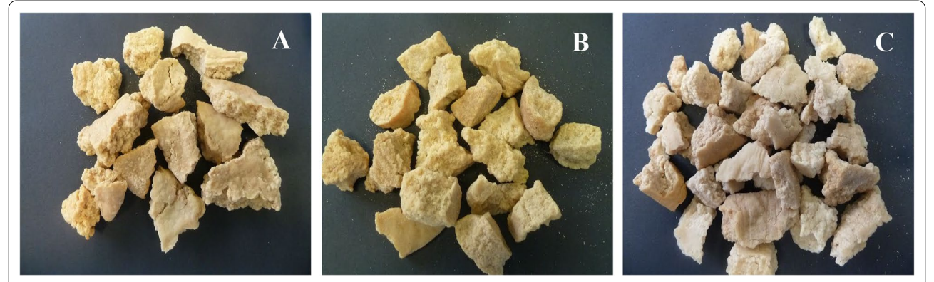
Fig. 2 Appearance of Klila cheese following the used milk. A: Klila made with goat milk. B: Klila made with ewe milk. C: Klila made with cow milk

In fact, depending on the season, the curd can be obtained in two different ways. Extreme