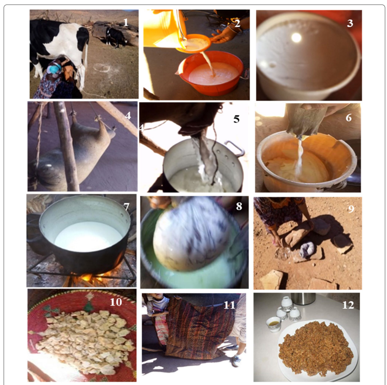
Fig. 4 Illustration of the main steps of the Klila cheese making. 1 Milking, 2 Filtration, 3 Clotting, 4 Churning, 5 Lben, 6 Butter, 7 Cooking, 8 Draining, 9 Pressing, 10 Grinding, 11 Storage, 12 Zrizri

steps. To obtain Dhane, salt, Juniperus leaves and cotula flowers ( Juniperus thirifera L. and Cotula cinerea Delile) are added. After cooking, the supernatant is removed and the liquid filtered. The butter is then cooked again with barley semolina and onions. The semolina is finally removed from the liquid and mixed with dates, cooked and eaten as main lunch called "Tadiba". The remaining liquid is the Dhane butter.